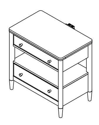
37568 2-D rawer Nightstand